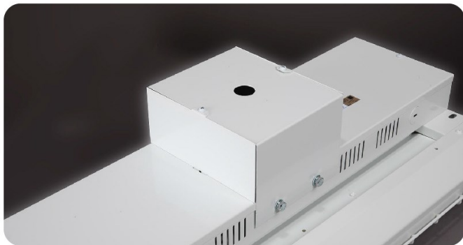
E2HBDH-PMK - Pendant mount kit